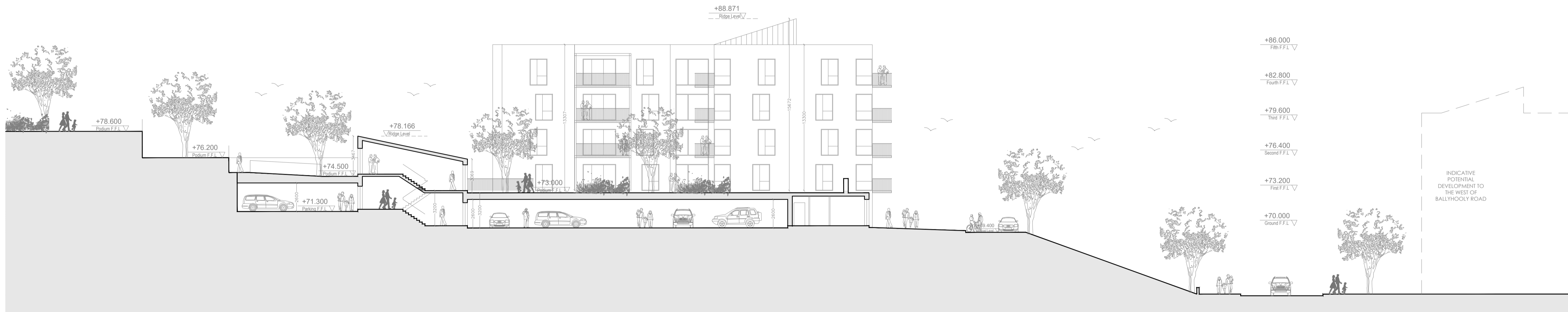
Site Cross Section 04 SCALE 1:200 @ A1